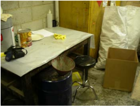
5S before and after